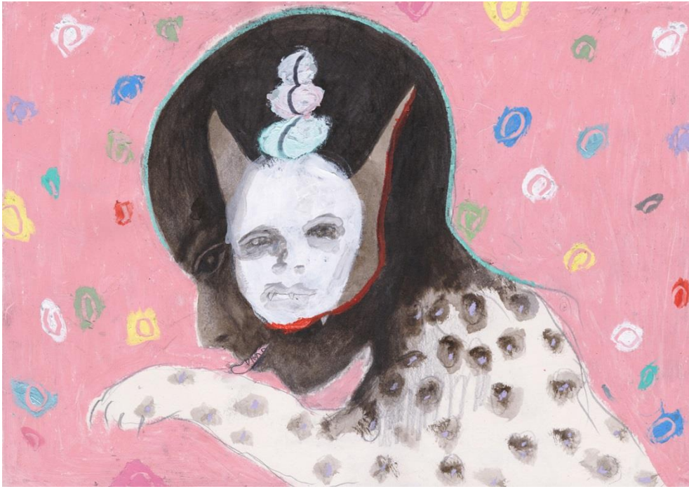
Emeli Theander, Leopard , 2017, graphite, ink and oil pastel on paper, 29,7 x 42 cm