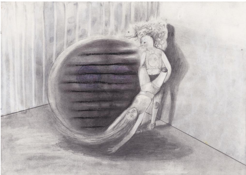
Spinning Around, 2016, graphite and soft pastel on paper 29,7 x 42 cm