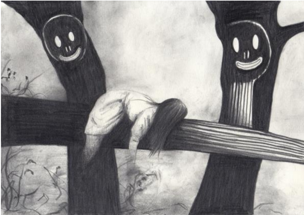
Emeli Theander, Forest , 2015, graphite on paper, 21 x 29,7 cm