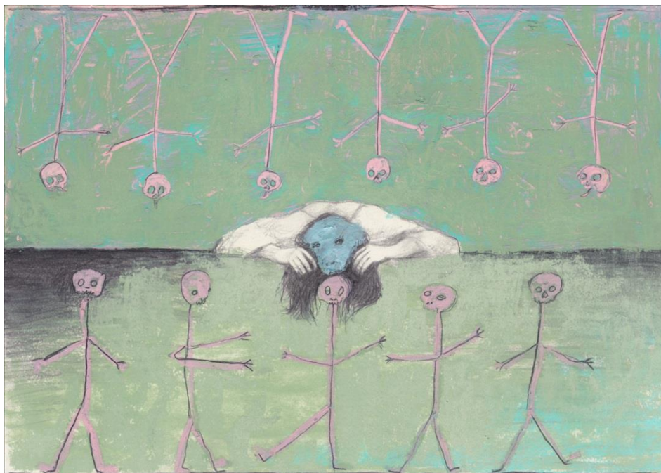
Emeli Theander, Skeletons , 2017, graphite and oil pastel on paper, 29,7 x 42 cm